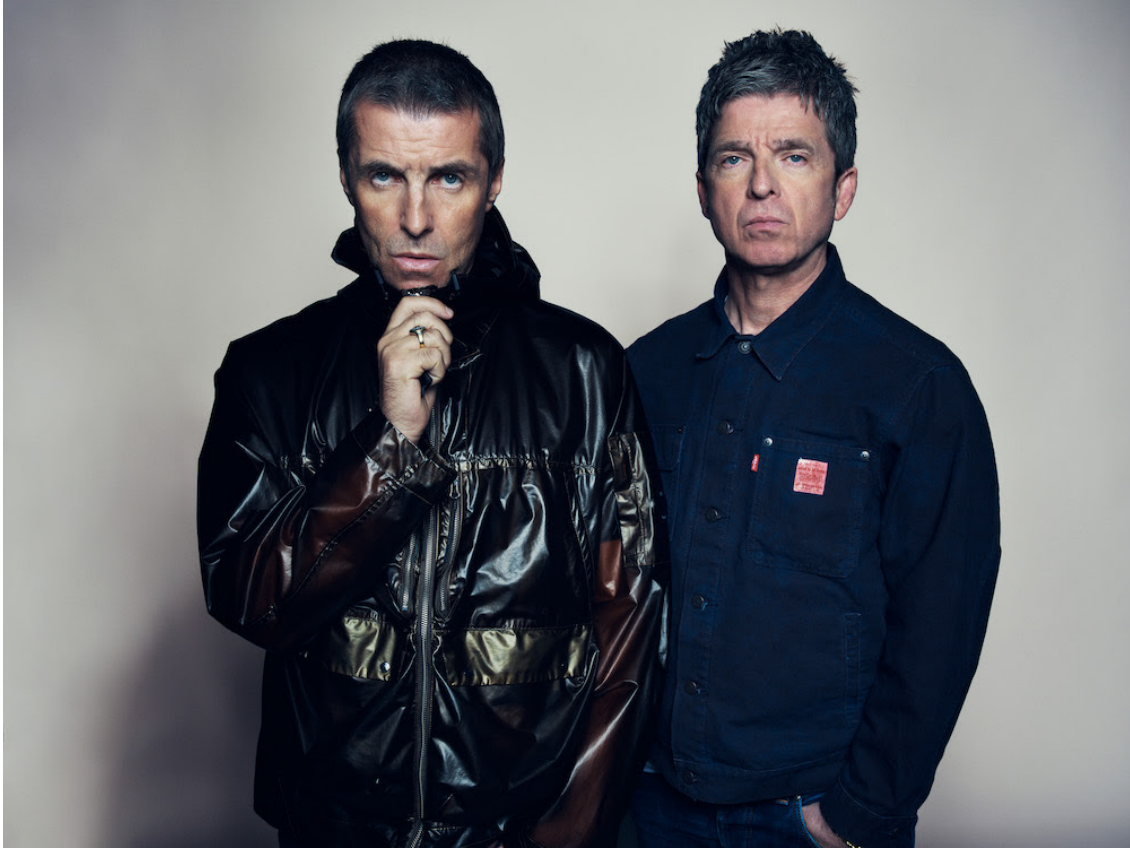
Photographer Credit: Simon Emmett – Download Hi-Res